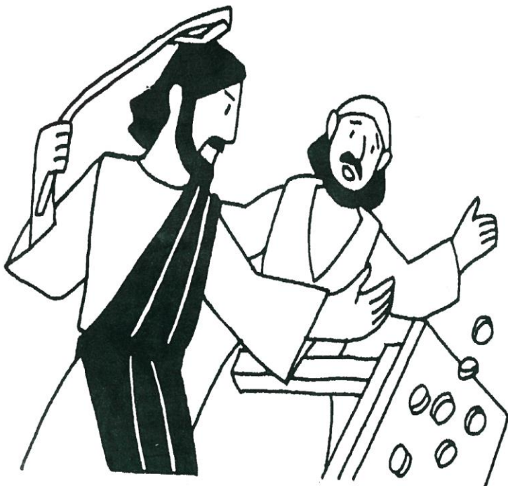
COLOUR IN PICTURE

He can drive out bad things like anger, lies, temper, jealousy, and pride. He can help you have good thoughts, love, joy, and kindness in your heart, and to be quick to obey in daily life. These things will help to make you and others happy. What kind of a temple would you like your heart to be?