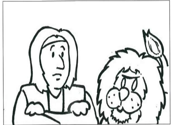
Daniel in the lion’s den

The King was sorry that he had given this new command. He realised he had been tricked into passing this foolish law by his own stupid pride. Even worse, the law of the Medes and Persians stated that a King’s command could not be broken (Daniel 6:12). So Daniel was taken off to the lion’s den. The King’s last words to Daniel were, “May your God, whom you serve continually, rescue you!”