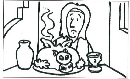
Daniel wouldn't eat the King's food

Daniel and his friends were chosen to be trained as King Nebuchadnezzar's servants. When they arrived in the palace, the first thing they noticed was that the menu looked great! In fact, they were to eat the same food as the King!