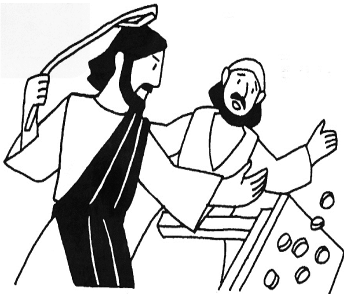
COLOUR IN PICTURE

He can drive out bad things like anger, lies, temper, jealousy, and pride. He can help you have good thoughts, love, joy, and kindness in your heart, and to be quick to obey in daily life. These things will help to make you and others happy. What kind of a temple would you like your heart to be?