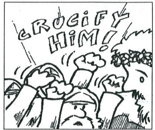
PILATE ASKED THE CROWD, 'WHAT SHOULD I DO WITH HIM?'

Jesus had done nothing wrong; in fact, He was the only perfect person who ever lived! As amazing as that seems, an even more amazing thing happened soon after. Jesus was crucified on Friday, and on the next Sunday some disciples of Jesus went to His tomb, only to find that it was empty! He had risen from the dead! This was the first Easter Sunday!