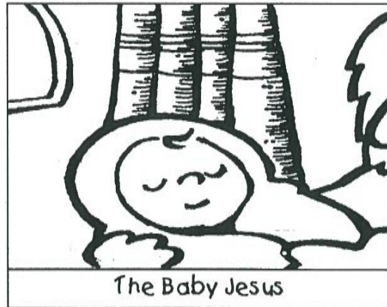
The Baby Jesus

DON'T MISS OUT! God gives us many chances in our lives to know Him and to be saved from the penalty of our sin. Make sure you take the opportunity He gives you!