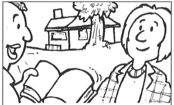
Sharing God's Word

When the Lord Jesus was about to leave earth and go back to heaven, He told His disciples to go and tell the whole world about Him (see the readings for today). One of those disciples was Peter, and he told this Good News about Jesus everywhere he went. One of the first times Peter preached, he told the people to repent of their sins and believe in Jesus to save them, and amazingly, about 3000 people were saved that day! (see Acts 2:36-41) Later on Peter wrote to his friends and told them to always be ready to tell others about the Lord Jesus and His wonderful love for all people. (see the Key Verse)