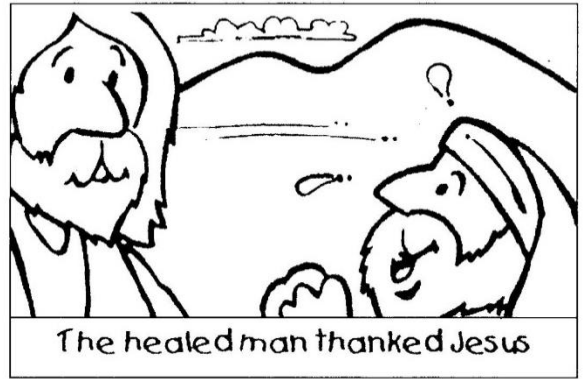
The healed man thanked Jesus

Jesus told them to go and show themselves to the priests, who were the only people allowed to say that someone was well enough to live in the cities again.