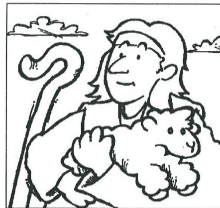
"BRING ME YOUR SON DAVID, WHO IS WITH THE SHEEP"

Samuel looked at all Jesse's sons until there seemed to be no more sons left. The Lord had said of each one, "He's not the one." Finally Samuel asked Jesse, "Do you have any more sons?" Jesse said, "Oh yes... David, my youngest, but he's out tending the sheep."