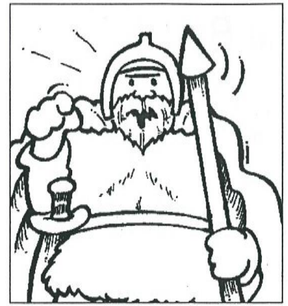
THE GIANT GOLIATH WAS OVER NINE FEET TALL!

Key Verse: "I can do everything through Him [Christ] who gives me strength." Philippians 4:13