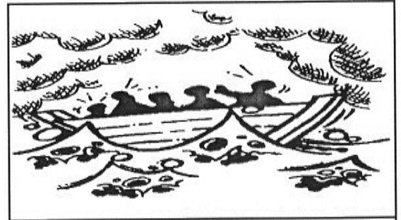
Stormy weather for the disciples

Meanwhile, the sun had gone down and the disciples were still trying to make their way across the lake, but it was a struggle. The winds were strong, and huge waves were tossing the little boat about like a cork! When Jesus saw the trouble that the disciples were in, He decided to go out to them - walking on the water!