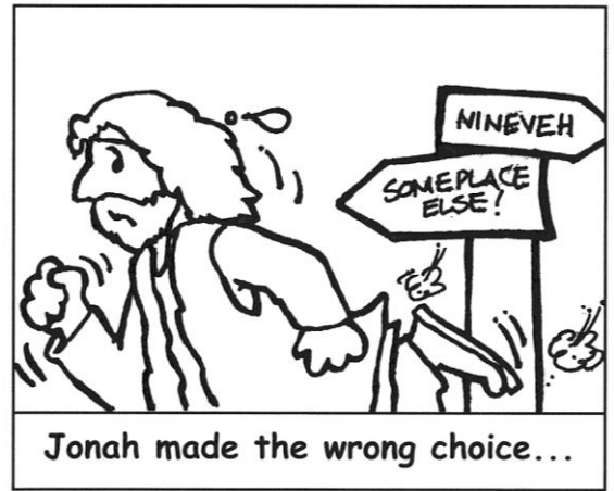
Jonah made the wrong choice...

Jonah went down to the wharf and caught a boat to go across the sea, as far away from Nineveh as he could get! And many of you will know what happened next. Yes, God sent a terrible storm that threatened to sink the little ship that Jonah was on.