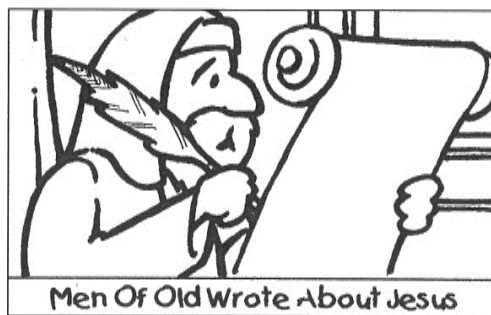
Men Of Old Wrote About Jesus

A King: Throughout the Bible, the Lord Jesus was talked about as a King, even before He was born!